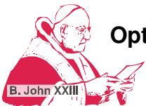
B. John XXIII

Option for the Poor and Vulnerable: Those who, for any reasons, are poor and powerless must not be left behind; their rights must be protected.