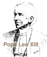
Pope Leo XIII

Dignity of Work and Rights of Workers: The economy must serve the community. Work is a way of taking part in God's creation. All have the right to perform productive work, organise, earn decent wages, and own private property.